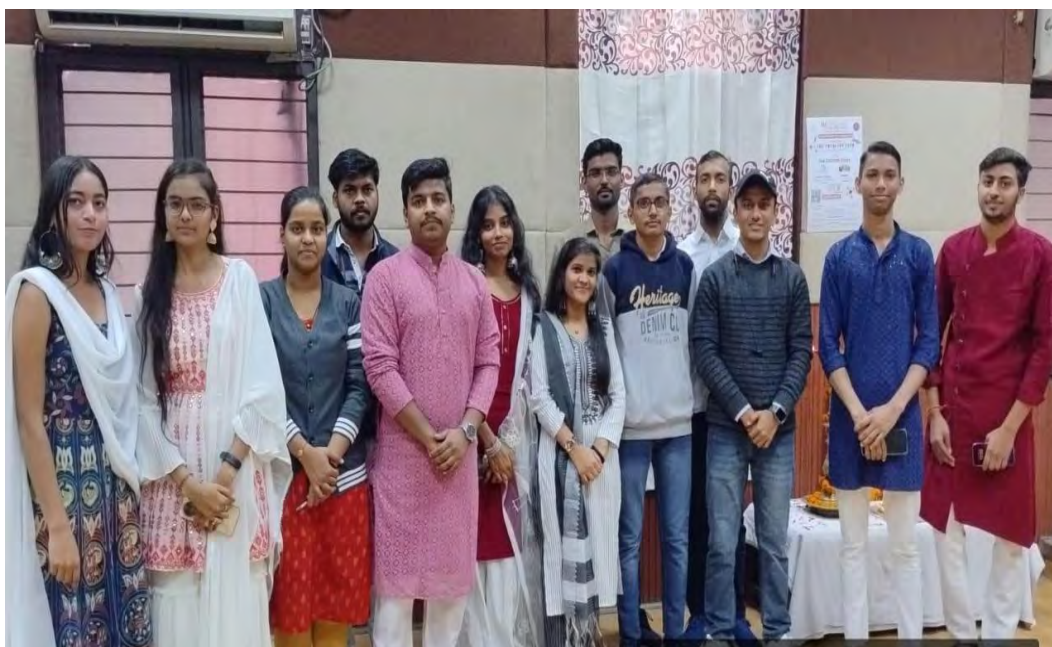
Core Team Members of the Catalyst Club