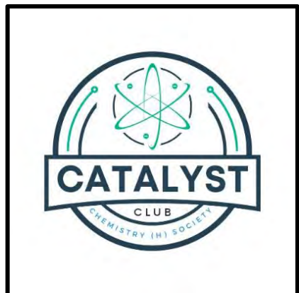
Logo of "The Catalyst Club"